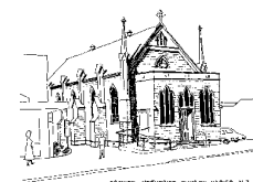
Trinity Methodist Church