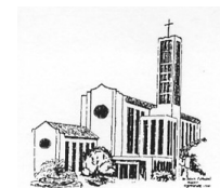
Waiapu Anglican Cathedral of St John the Evangelist