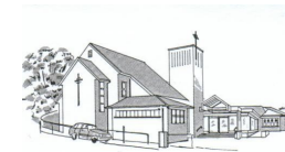
St Paul's Presbyterian Church