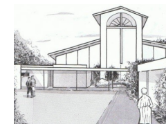
St Patrick's Catholic Church