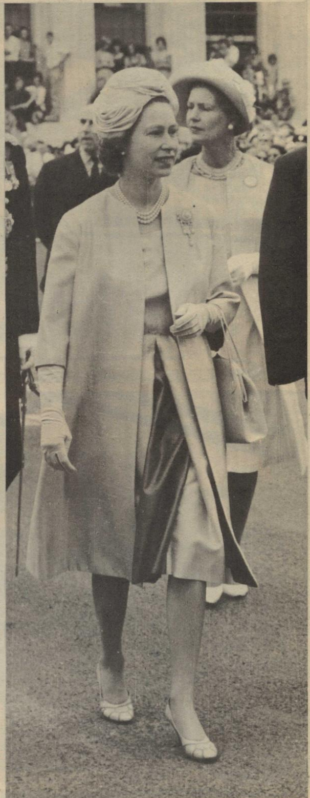
Her Majesty at the entrance to St. Paul's Presbyterian Church.