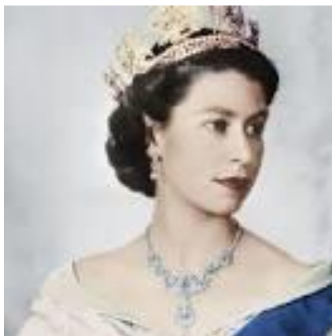
Elizabeth Alexandra Mary Windsor, Her Majesty Queen Elizabeth II, born 21 April 1926; died 8 September 2022

Here at St Paul's Presbyterian Church, Napier, we remember and pay tribute to this incredible woman with some photographic memories of Her Majesty's trips to New Zealand. In particular, we celebrate the royal attendance at St Paul's Church worship service on Sunday 10 th February 1963. Please join us in a call to prayer as we continue to reflect on this significant moment in time and what this means to the nations. We pray that Her Majesty Queen Elizabeth's II legacy of faith, stability and service will continue to inspire not only her descendants but many others around the world. May the Lord's grace and peace be upon us all.