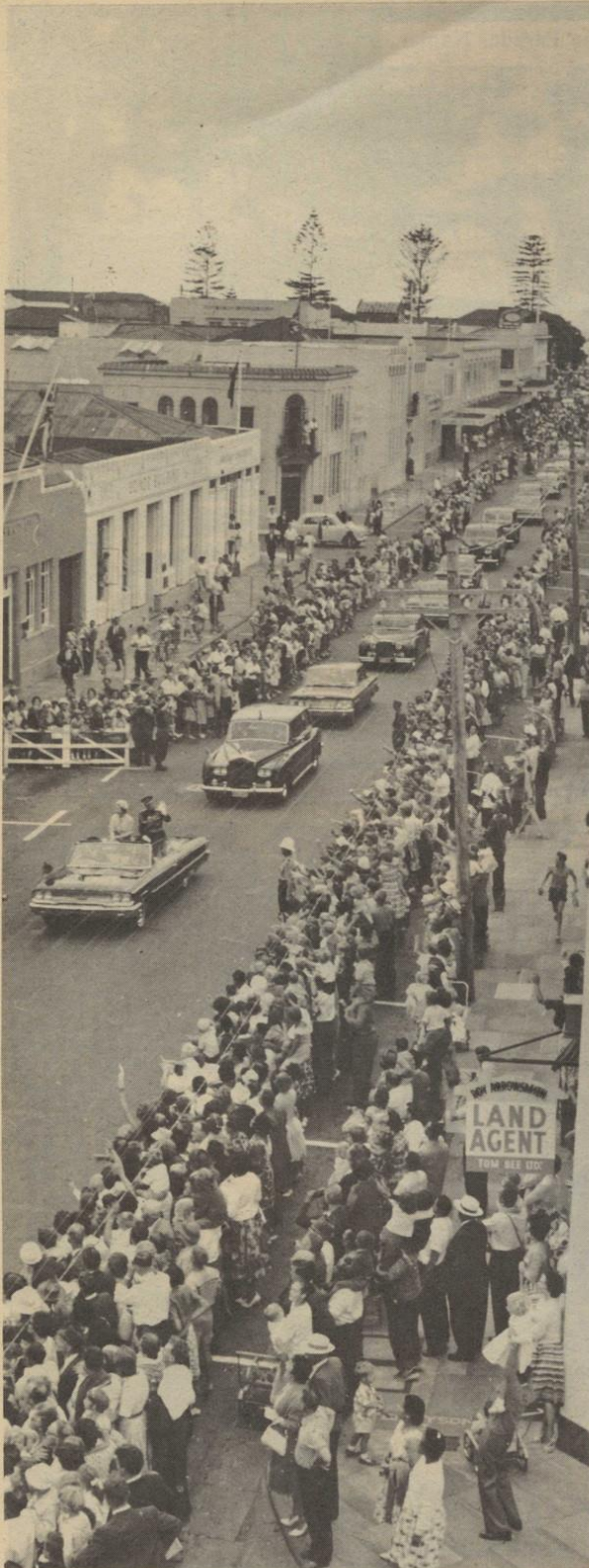
The Royal Entourage travelling along Tennyson Street.